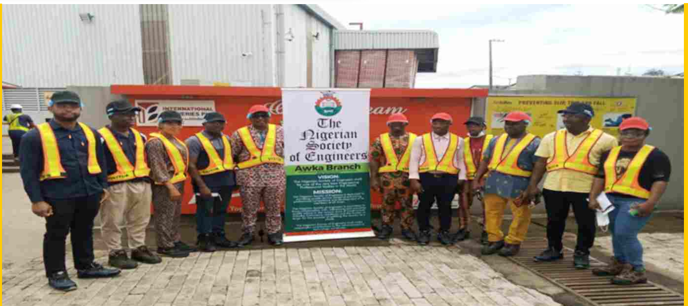
Industrial visitation at International Breweries PLC, Niger Bridge industrial layout, Onitsha 1