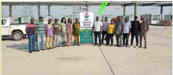
Group photograph of NSE, Awka Branch with the Controller of Works at the Asaba Toll gate link of the Second Niger Bridge.