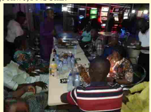
Dinner party to welcome the Deputy President and the entourage